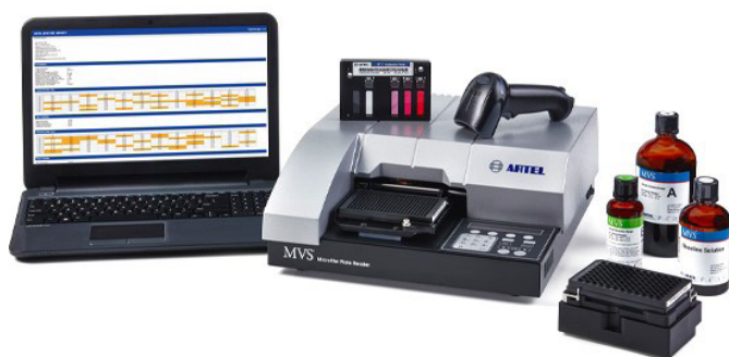
Figure 2: Artel Multichannel Verification System (MVS)