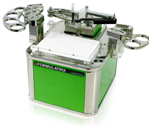
Figure 3: FORMULATRIX® MANTIS® Liquid Handler